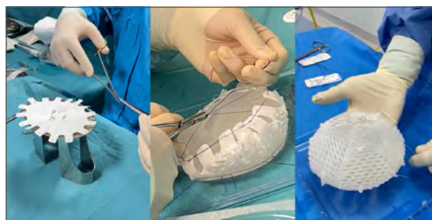
Figure 1. Intra-operative aspect of the mesh.

If necessary, Cranial, caudal, medial and lateral borders of the mesh were secured to the pectoral fascia with absorbable 2-0 interrupted stitches (Vicryl®, Ethicon, Norderstedt, Germany). Once the implant has been positioned one vacuum drain (Jackson-Pratt, calibre: 10 mm) was inserted in the inframammary fold and patients received Gentamicin 80 mg intravenous solution for three times a day for three days and oral Cephalosporin class antibiotics until surgical drains were removed. After applying a compressive wound dressing