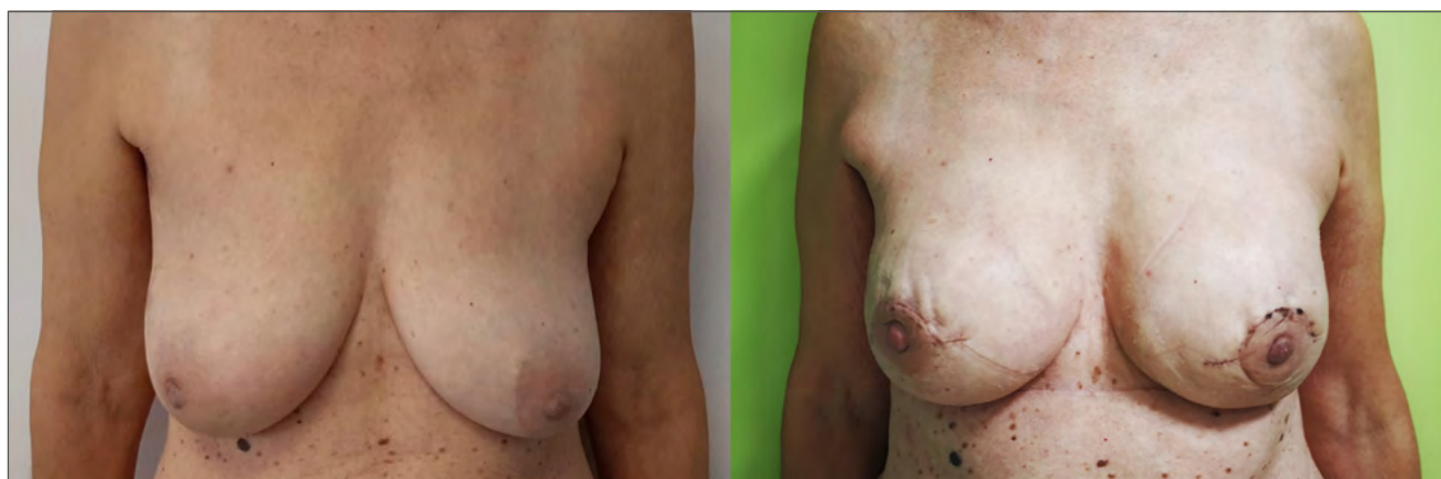
Figure 3. A bilateral mastectomy case: pre-operative view (on the left) and post-operative view (on the right) three months after surgery.